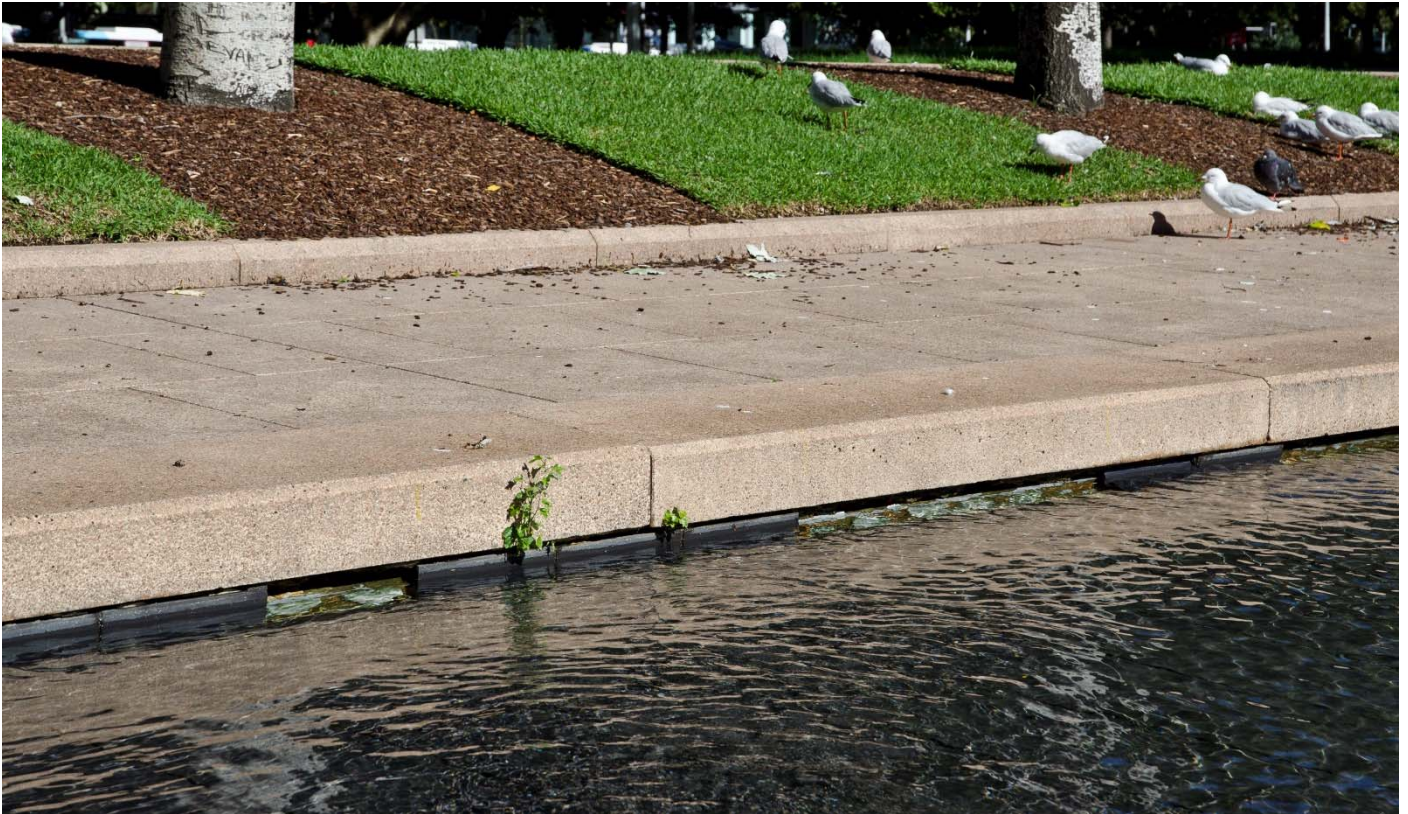
Image a) Pool of Reflection – damaged tiles within the pool need to be replaced