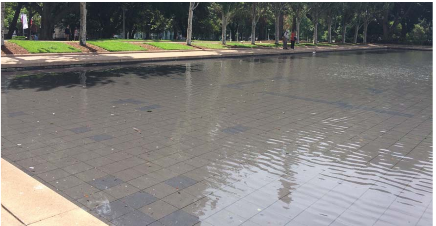
Image b) Pool of Reflection- damaged tiles have been replaced creating a patchy visually effect. The grout between the tiles in many sections is missing.