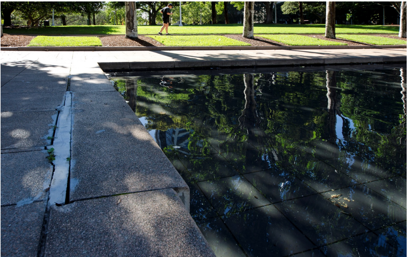
Image d) Pool of Reflection- the surrounding coping is collapsing into the pool and gaps have been patched with concrete.