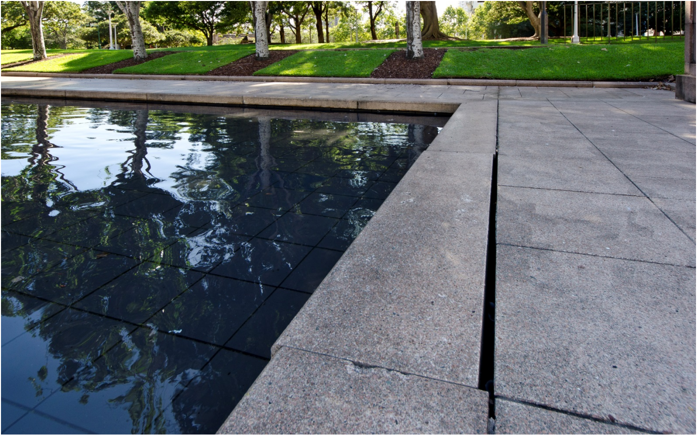
Image c) Pool of Reflection- the surrounding coping is uneven and collapsing into the pool